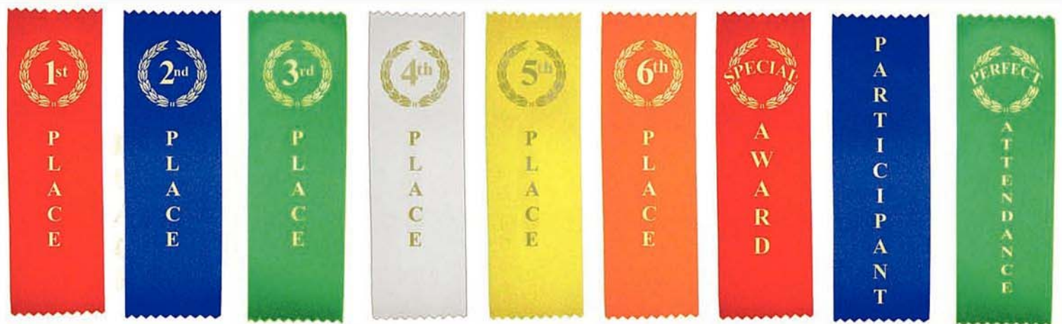
MR100 MR101 MR102 MR103 MR104 MR105 MR106 MR107 MR108